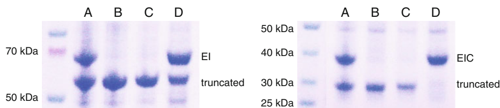
Fig. 3 Expression of full-length (residues 1–575) EI M469 pAcF/C575A (left panel) and EIC A494 pAcF/C575A (right panel) in different media. Lanes A, B and C correspond to expression in LB, M9^{H_2O} and M9^{ISO} media (see Table 1), respectively. Lane D

corresponds to expression performed by pre-inducing the pEVOL plasmid in LB medium prior to moving the culture to the deuterated M9^{ISO} medium. The left-hand most lane in each panel displays standard molecular weight markers